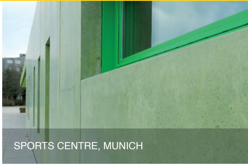
SPORTS CENTRE, MUNICH