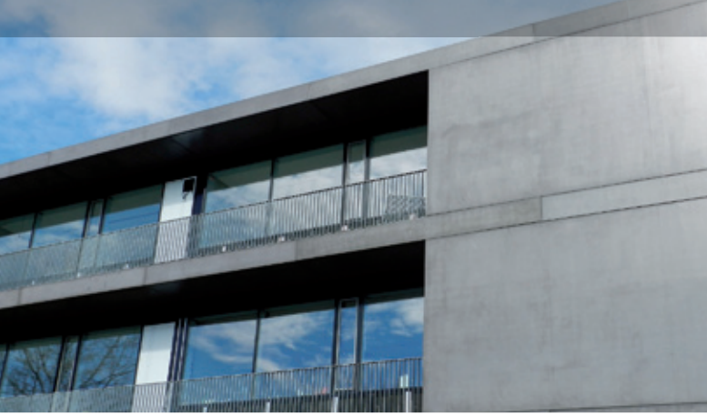
SECONDARY SCHOOL, NÜRTINGEN