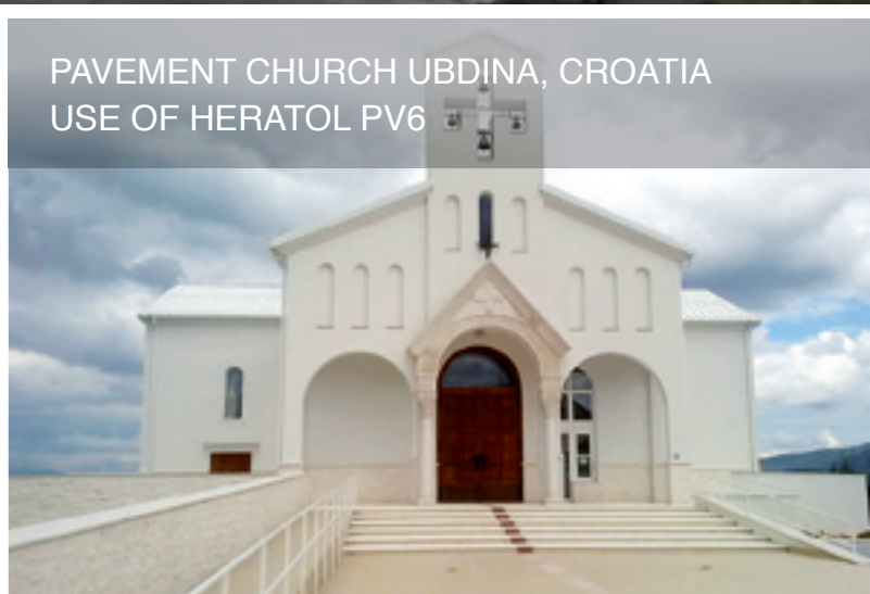
PAVEMENT CHURCH UBDINA, CROATIA USE OF HERATOL PV6